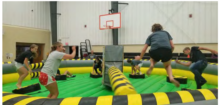
PROM & POST PROM 2020