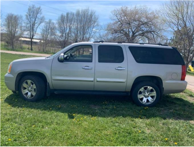
2007 YUKON XL 4-wheel drive. 224,000. $7500

We are selling our minivan and Yukon. Both great cars just upgrading!