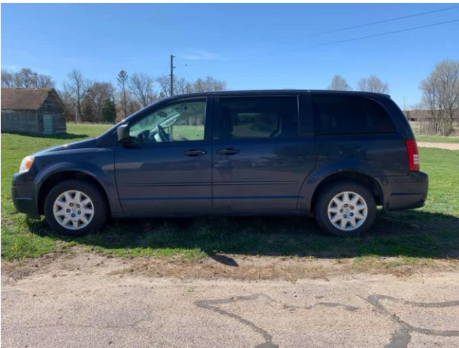
2008 Town and Country. 211,000 mostly road miles to gymnastics. Stow & go! Great mpg!